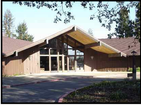
Grace Hudson Museum 431 S. Main Ukiah, CA